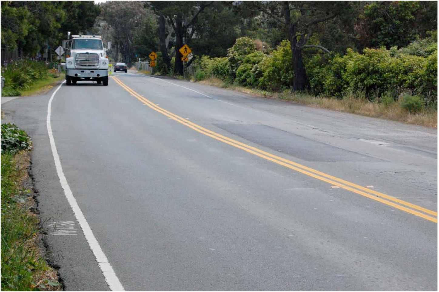
Eastbound view of Shoreline Highway at crash scene. Note how closely the truck in the photos is to the fog line. Additionally, note how narrow the shoulder is on the Westbound lane (with truck), and how much more shoulder there is for the Eastbound lane. The yellow centerline could be moved to provide more shoulder room in the westbound lane.