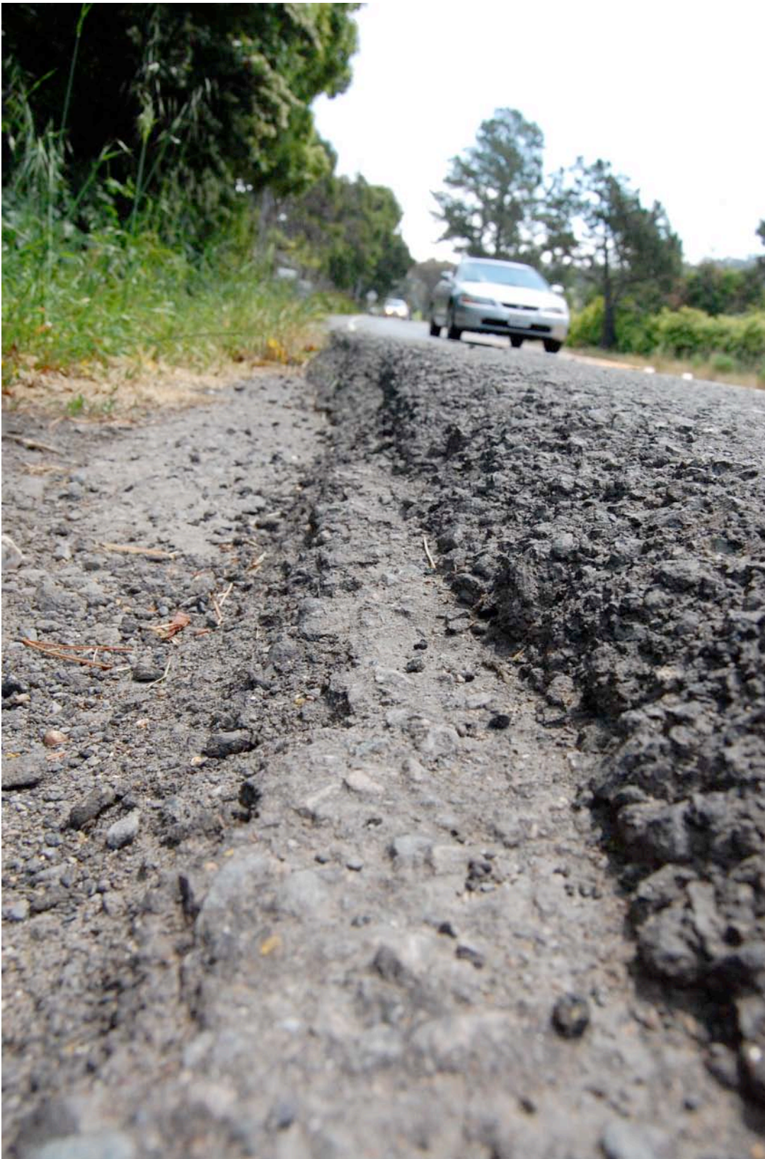
Edge of pavement at crash site. Three asphalt overlays can be seen. The fog line is faintly visible to the left of the car. Note the pavement steepness and degradation in conjunction with asphalt crumbling and forming loose gravel.