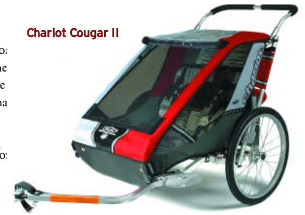
Chariot Cougar II

cargo rack accessory is clever and useful, but it too is limited to five pounds. We'd also like to see the aluminum wheels, which are not covered in the warranty, make the jump from twenty-four to thirty-six spokes. Finally, the Cougar's fabric is listed as water-resistant, not waterproof. While we didn't encounter problems during our tests, this is a drawback for tours or for the dedicated year-round cyclist.