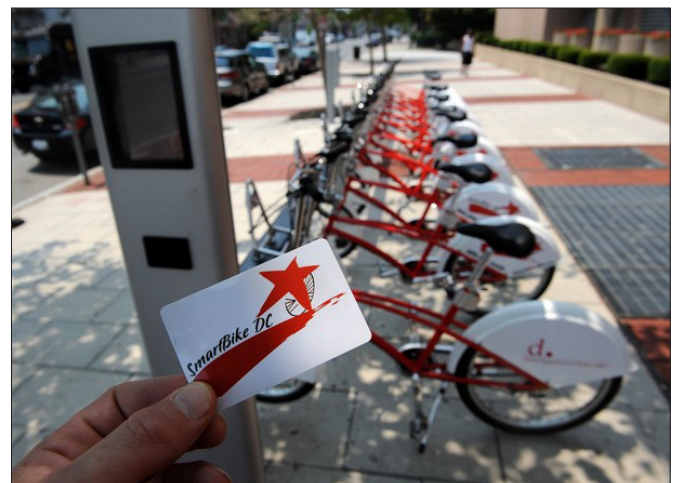
The Washington D.C. bike share program uses smart card technology.