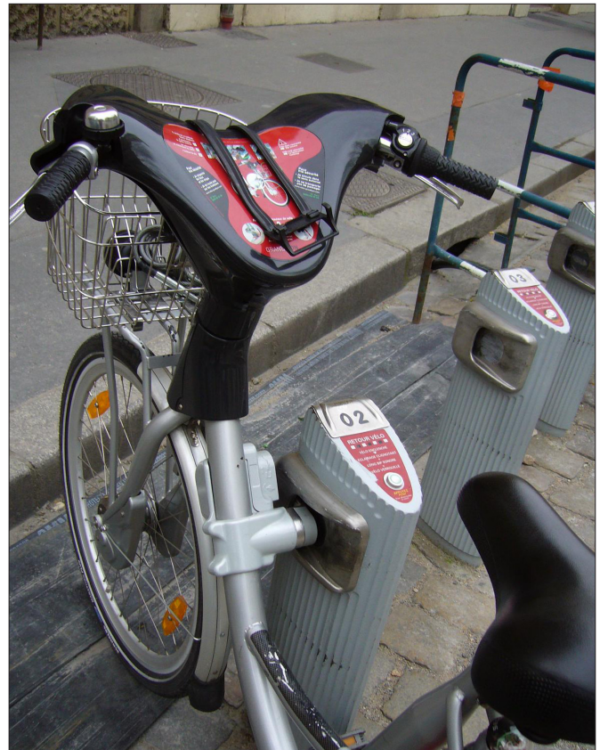
Fleet bikes such as this one in Lyon, France can include a number of innovative features.

Existing and proposed bike share programs employ a wide variety of technologies, and "lessons learned" are being continually applied to new systems. For a bike program to be successful it is important that the correct technology and package of services involved be mated to the unique challenges that each program faces. For this reason it is strongly recommended that each agency considering implementation of a bike share program have an independent assessment of community needs, economics, technologies, logistical issues, service area, and other challenges faced by a final system.