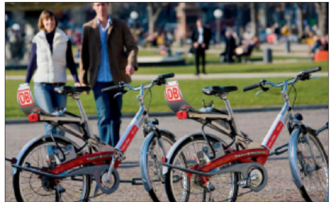
Fleet bikes, such as those used in DB Bhan system should be easily distinguishable.

Fleet bikes should be distinctive, designed for easy city use, and be clearly branded to increase their visibility. Bikes typically come with full fenders, chain guards and, in some cases, bike locks. Most bikes come equipped with a Global Position System (GPS) unit, Radio Frequency Identification (RFID) tag, or other type of tracking mechanism. This function is typically used in fleet management and location of lost or stolen bikes.